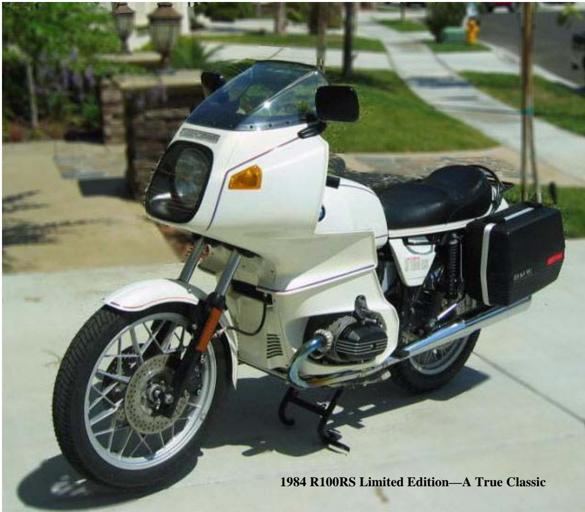
1984 R100RS Limited Edition—A True Classic